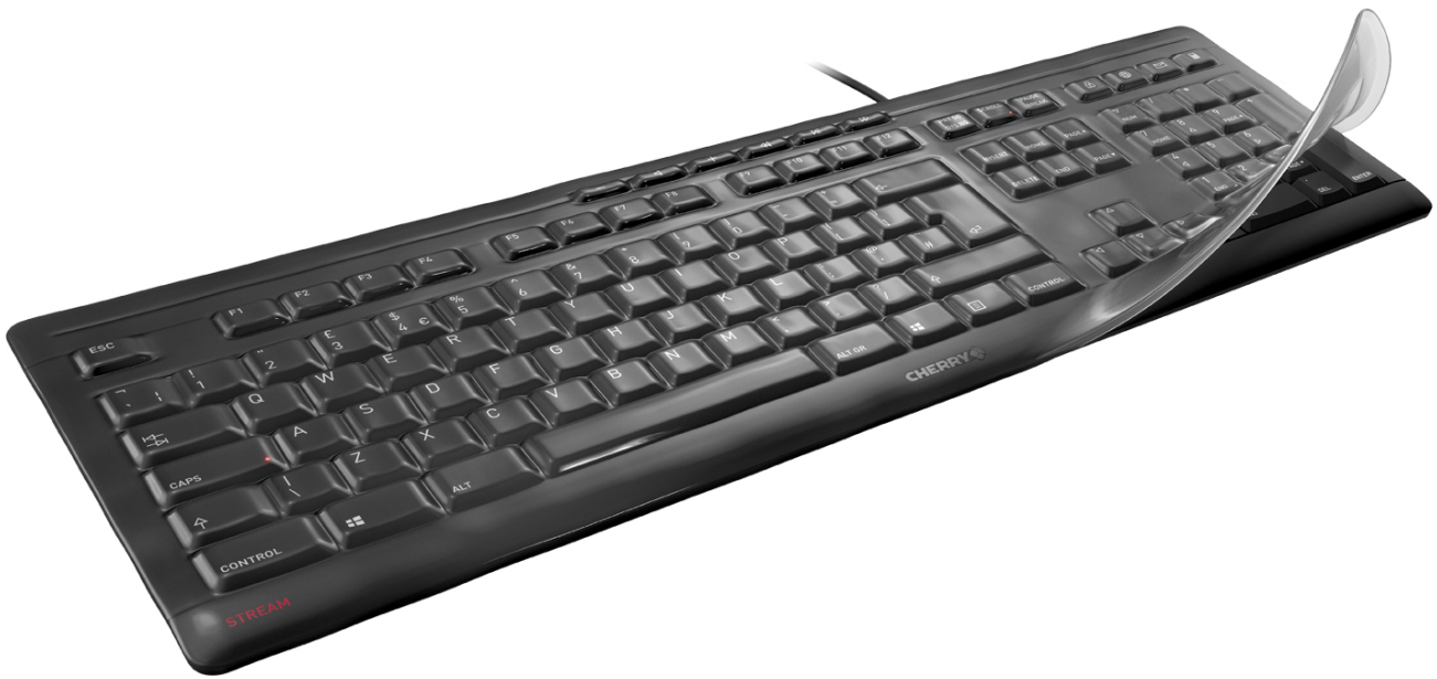
Picture: CHERRY STREAM KEYBOARD (JK-8500GB-2) with WetEx®-protective film